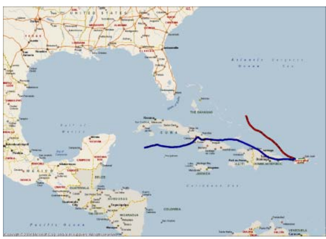
Figure 1. Paths of the two NOAA smart balloons launched from Puerto Rico during the RAINEX experiment. The path of balloon 1 is shown in red dots, while the path of balloon 2 is shown in blue dots.

18. Smart Balloon. Two NOAA smart balloons were launched from Puerto Rico in an effort to place the balloons into a hurricane during the RAINEX experiment. Balloon 1 was launched at about 0120 hours (GMT) on September 8<sup>th</sup>, 2005. It tracked to the northwest in the direction of Hurricane Ophelia. After tracking the balloon for nearly a day and half, the solar radiation increased but the solar panel charging current remained at zero. This was monitored for a few hours and when it was determined for sure that the batteries were not going to charge, the balloon flight was terminated while battery power was good and we could ensure the balloon did drop into the ocean.