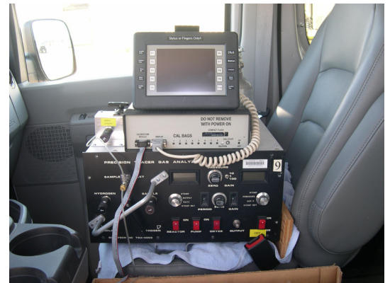
A fast response analyzer that measures tracer concentrations every second. The analyzer is easily carried on a seat of a vehicle.

The \text{SF}_6 analyzers include a computer controlled calibration system and an integrated global positioning system (GPS) that tags each data point with sampling time and location. The systems can be used in cars, boats, aircraft, and buildings. The current configuration easily sits in an automobile or aircraft passenger seat and attaches with standard seat belts.