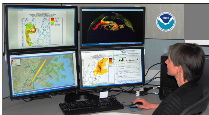
Examples of HYSPLIT simulations.

HYSPLIT is also heavily used by academia, private companies, and other U.S. and international government agencies. Users may download the model to their computer, or they may run the model in a variety of web-based venues. In 2017, a new record was set with over 1.2 million HYSPLIT simulations performed using ARL's web server.