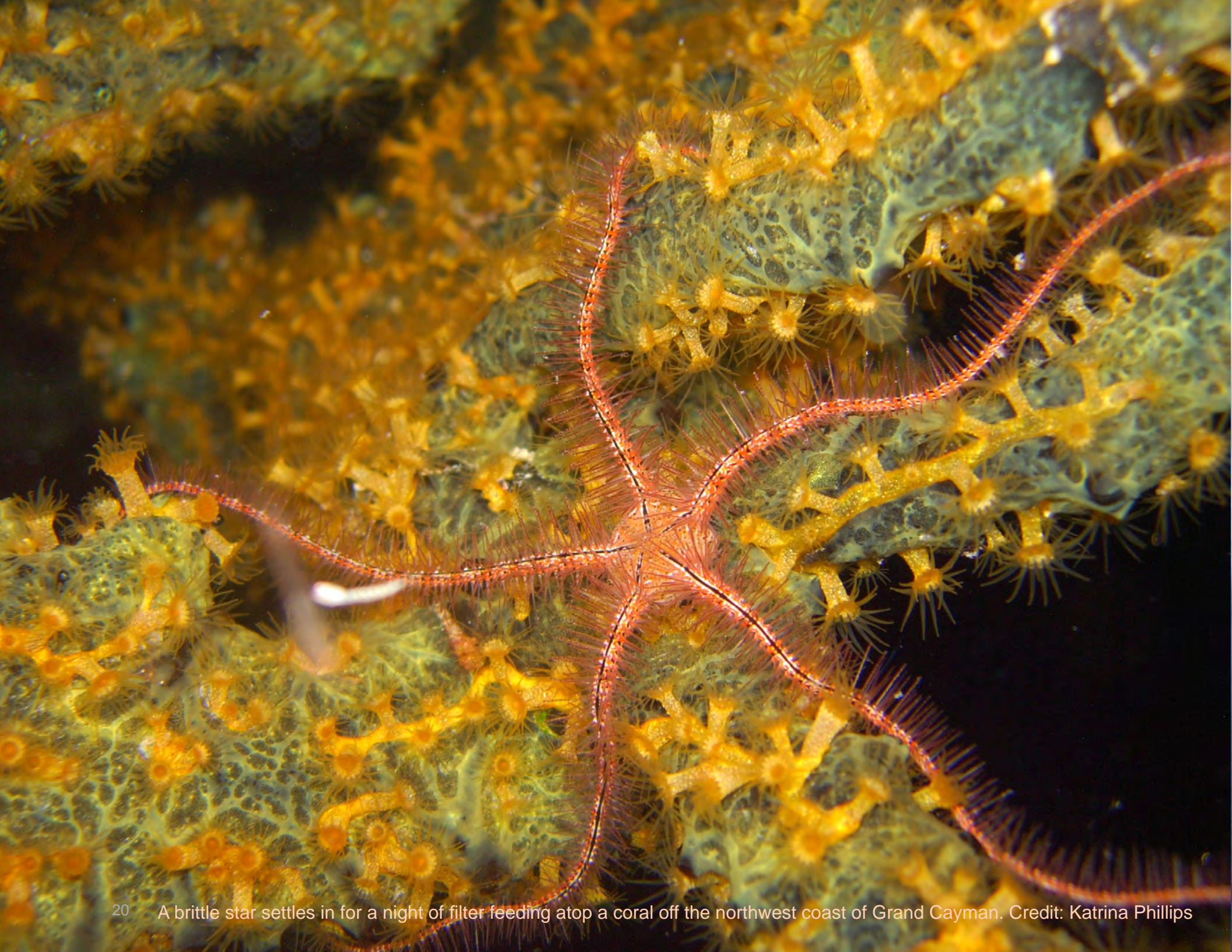
20 A brittle star settles in for a night of filter feeding atop a coral off the northwest coast of Grand Cayman.