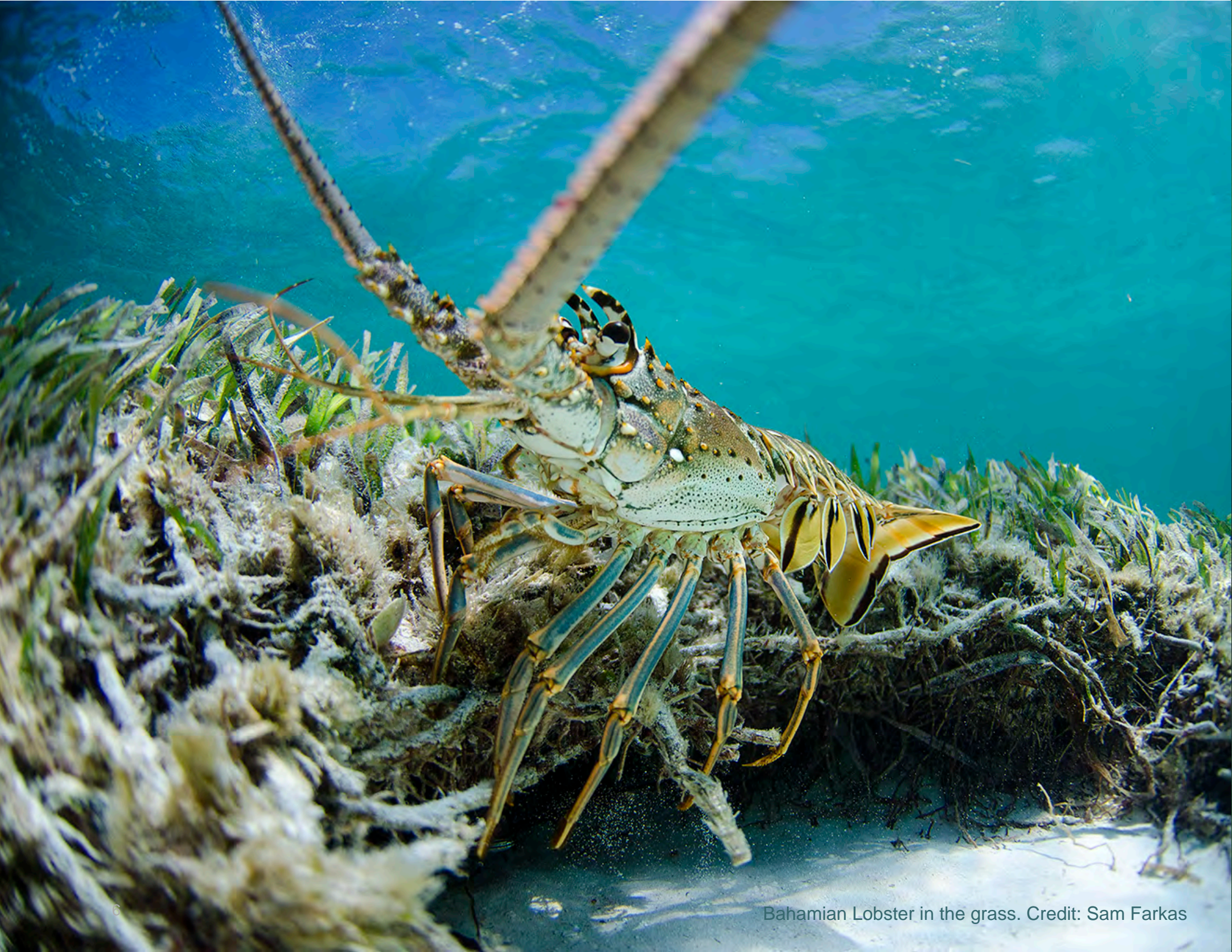
Bahamian Lobster in the grass.