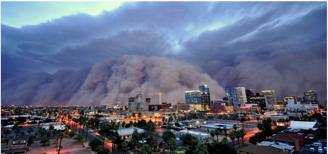
Dust storms are becoming more frequent in the western United States.