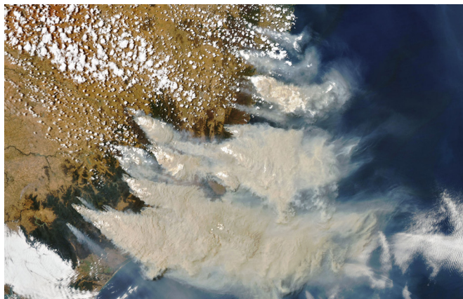
Smoke plumes from massive wildfires in Australia on Jan. 4, 2020, Image credit: NASA