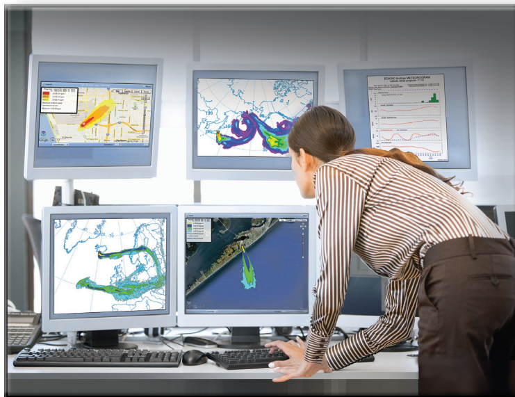
Examples of HYSPLIT simulations and data.