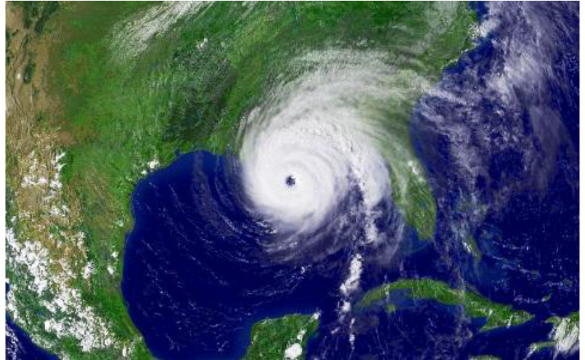
Image of Hurricane Ivan in 2004.

The danger and cost of hurricanes continue to be demonstrated with each hurricane season. A hurricane builds energy as it moves across the ocean, feeding on warm, moist tropical air near the surface. Both the intensification and eventual decline of these storms are linked to turbulent exchanges of heat, water vapor, and momentum between the lower part of the atmosphere and the underlying water and land surfaces. Yet, these exchanges are poorly understood because turbulence measurements in hurricane conditions are difficult to acquire. Most turbulence instruments can not handle hurricane force winds and intense rain. Better turbulence observations in hurricane conditions would allow researchers to develop improved representations of air-surface exchanges in models, increasing the accuracy of hurricane forecasts.